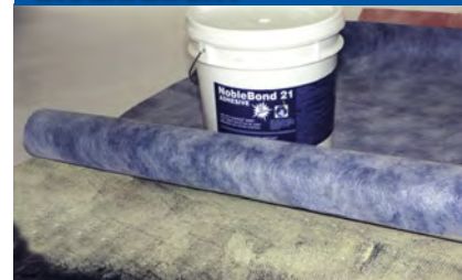
1. Spread adhesive.