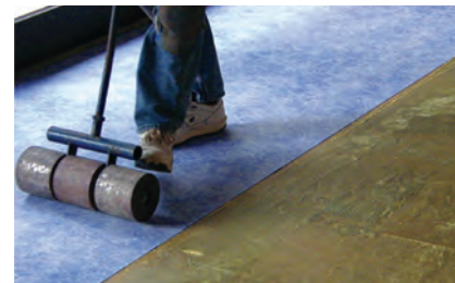
2. Embed sheet.