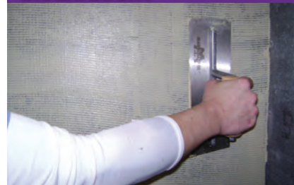
1. Apply bonding agent (NobleBond EXT or latex modified thin-set).