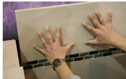
3. Install tile.

* CAUTION: Read complete installation instructions prior to installing.