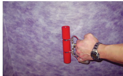
2. Embed Wall Seal with hand roller or straight edge.